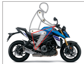
Comfortable Upright Riding Position