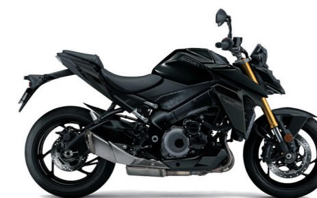
Glass Sparkle Black (YVB)