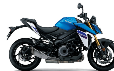
Metallic Triton Blue (6CX)