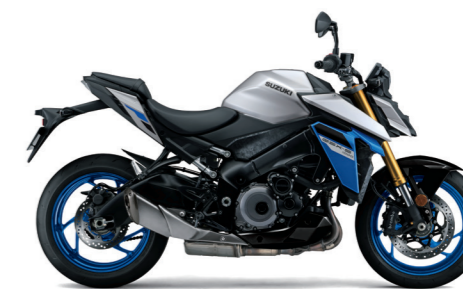
Metallic Mat Sword Silver (CSX)