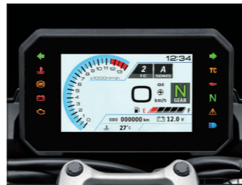
Color TFT Multi-function Display